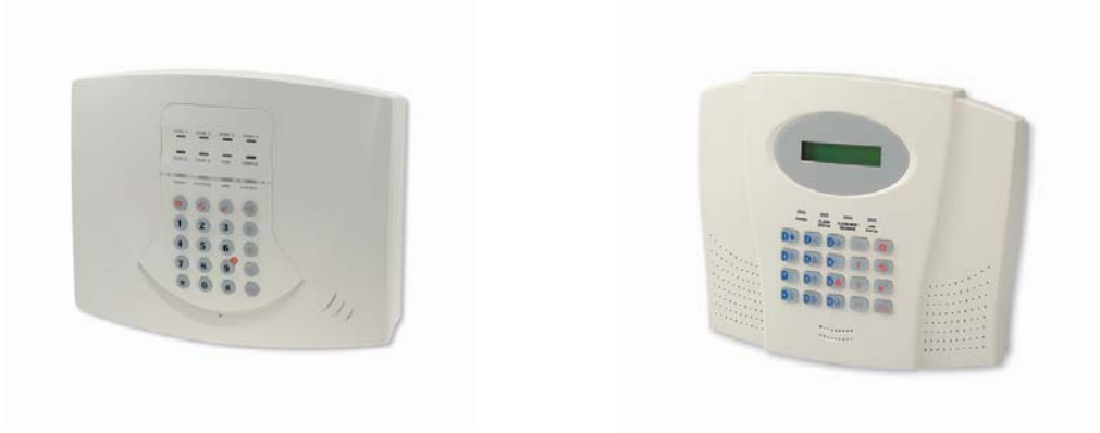
Control Panels with Communicating Auto Dialler