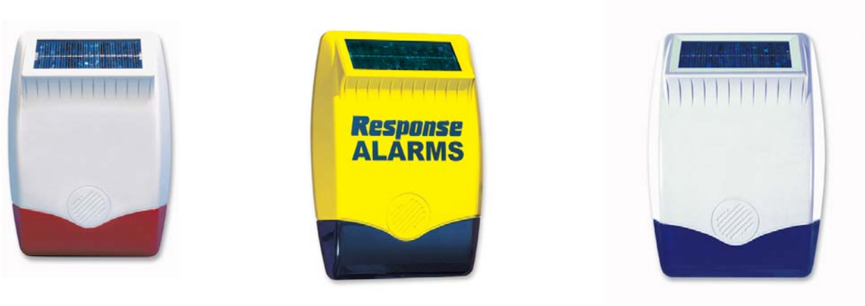
Solar Sirens with Strobe and flashing Comfort Lights